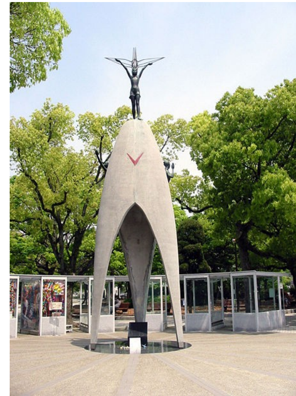
Peace monument of Sadako in Hiroshima